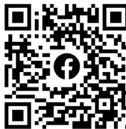
Facebook group QR code