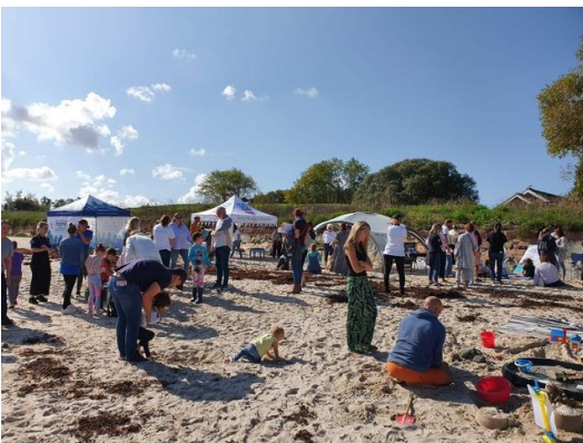
REAL on the beach

Events throughout the year to support families in completing some of the activities on the App Facebook Group created to support families